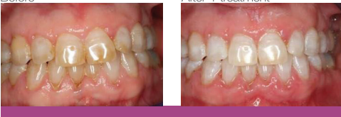
After 1 treatment